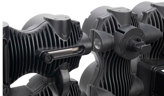
Fixture-to-Fixture Interlocking Alignment Pins/Locks